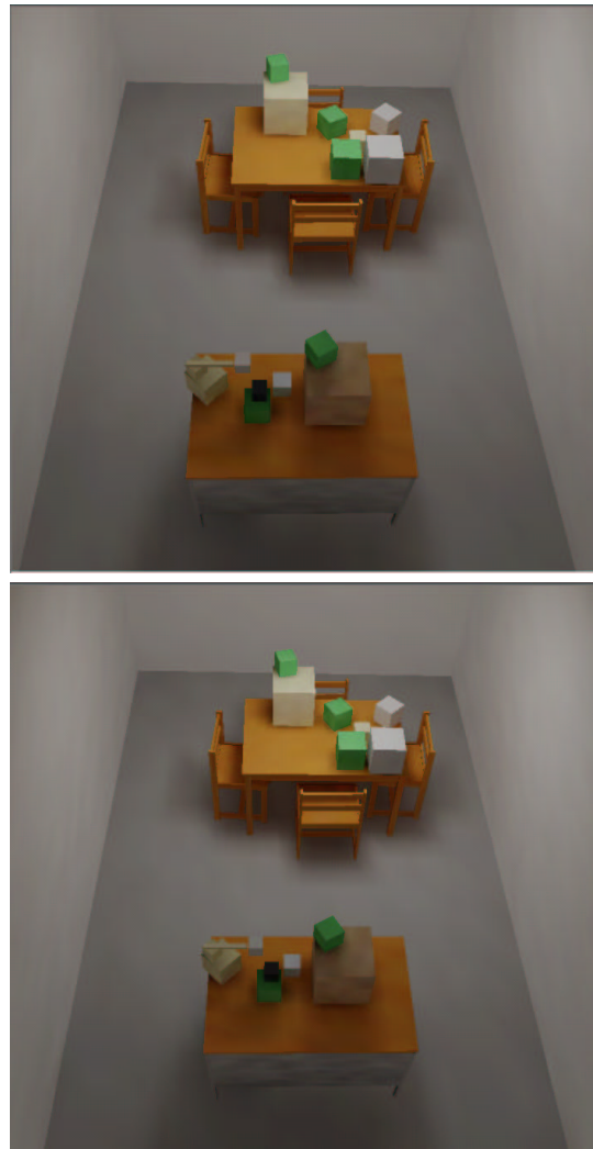
Figure 3. Frame n.17. (top) Classical algorithm. Time=340 sec. N.paths= 1920000. (bottom) New algorithm. Time= 41.4 sec. N.paths = 1920000 (including reuse). The error is practically the same in both cases, resulting in a speed up about 6.6.